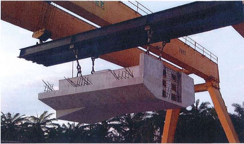
Segment – 2R