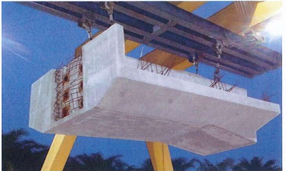
Segment – 2L